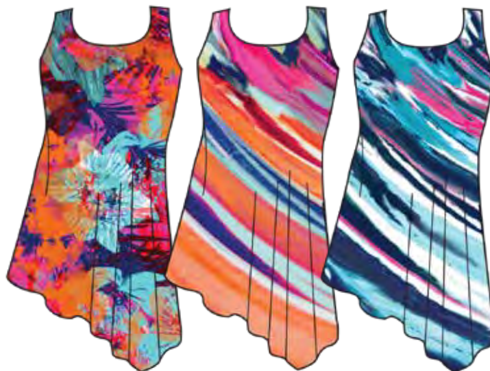
829 Orchid 827 Carrot 403 Twilight

These asymmetrical sleeveless tunics will have you leaning into your signature style. Balance it out with a solid cardigan or go bold with a matching floral topper.