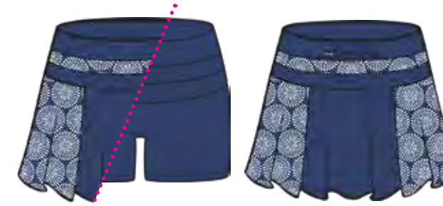
403 Twilight with attached short