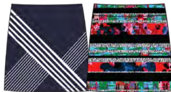
403 Twilight 001 Floral Stripe Black

Pull on this straight, striped skirt and dress it up with a knit top or go casual in a solid tee.