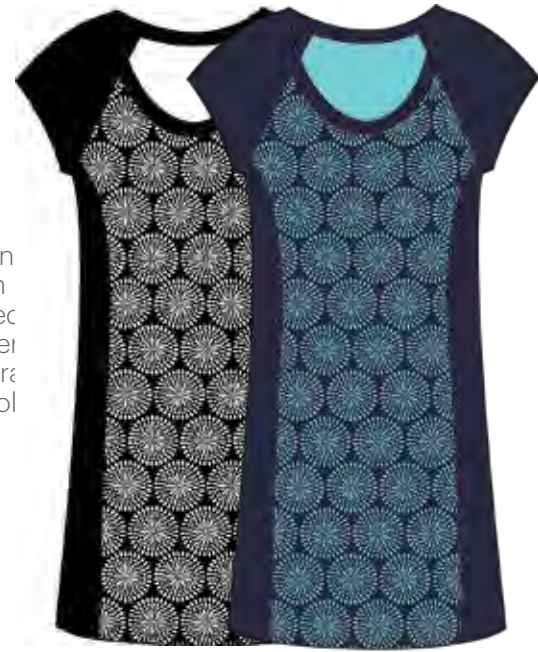
001 Black 403 Twilight

This dress is right on trend with a pattern that's neither painted nor printed, but laser cut to reveal a contrasting layer in a pop color.