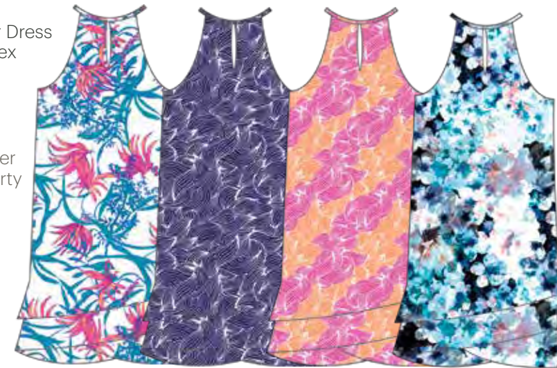
444 Tropical 505 Leaves Parachute 671 Leaves Rose 403 Digital Floral

35" Petal Halter Dress Rayon / Spandex XS-XL