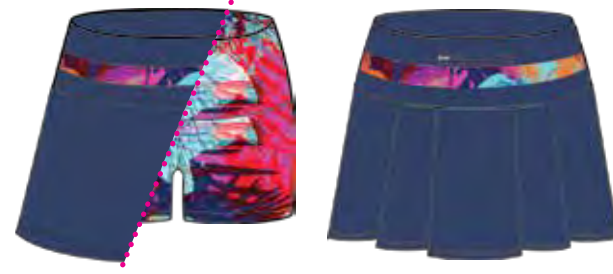
829 Orchid with attached short