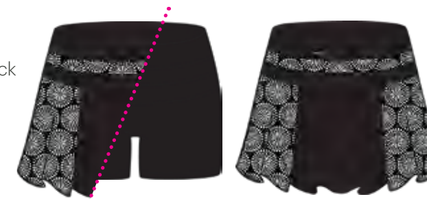
001 Black with attached short

This skort features laser-cut panels and a key pocket at the back waistband for a sporty skirt that's flirty, functional and fun.