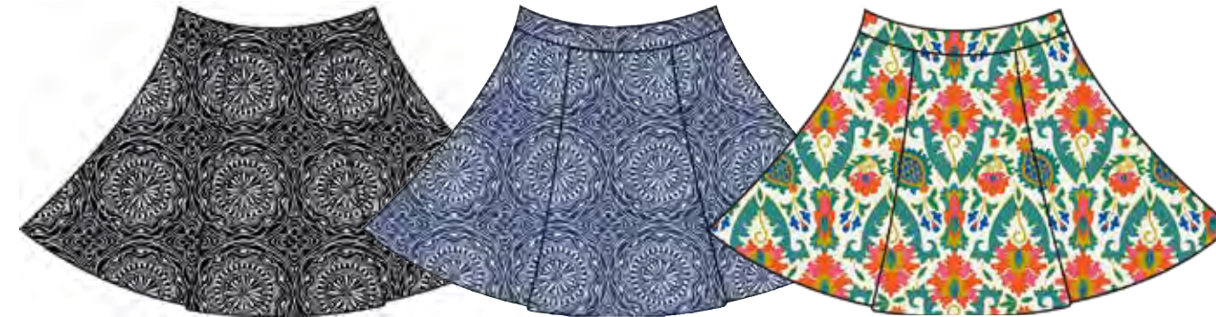
001 Medallion Black 401 Medallion Twilight 100 Wallpaper White