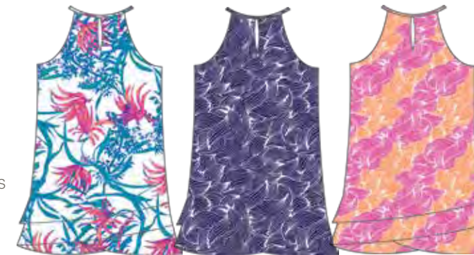
444 Tropical 505 Leaves Parachute 671 Leaves Rose

25.5" Petal Halter Top Rayon / Spandex XS-XL