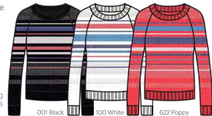
001 Black 100 White 622 Poppy

The pointelle detailing and light fabric are perfect for throwing over your suit or keeping those night breezes at bay.