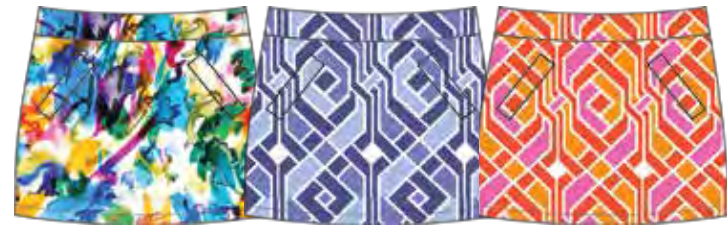
100 Watercolor 450 Stained Glass Denim 671 Stained Glass Rose

16" Printed Skort 4" built-in mesh short Zip pockets in front Skirt: Cotton / Spandex Shorts: Nylon / Spandex XS-XL