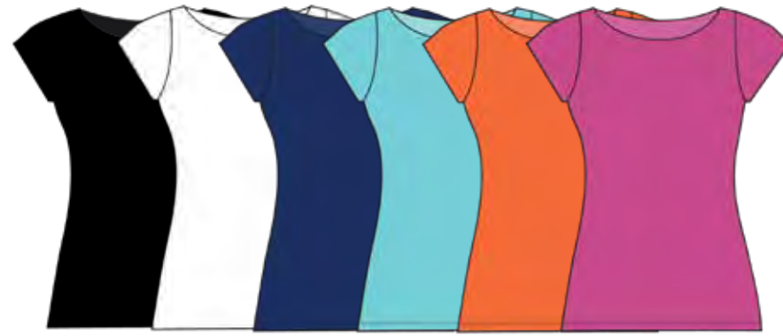
001 Black 100 White 403 Twilight 449 Rain 827 Carrot 540 Raspberry

This solid tee is anything but basic in six vibrant colors and pairs perfectly with our patterned skirts.