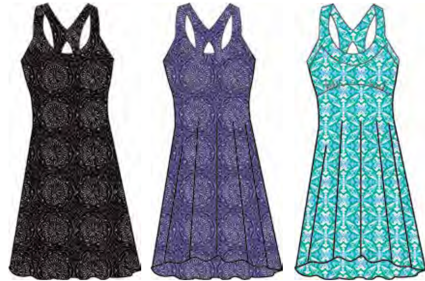
001 Medallion Black

This easy summer sun dress with a keyhole back detail is just the ticket to unlock your summer style.