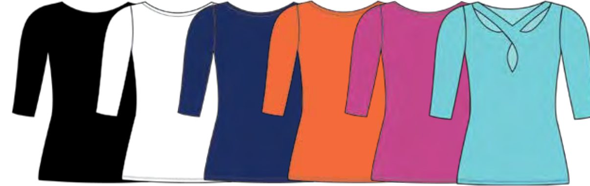
001 Black 100 White 403 Twilight 827 Carrot 540 Raspberry 449 Rain