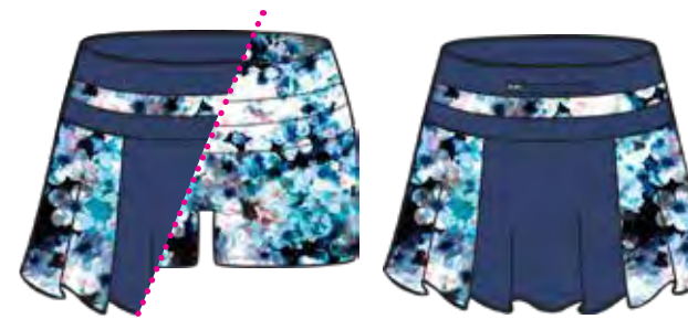
403 Digital Floral with attached short