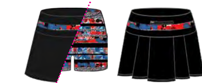
001 Floral Stripe Black with attached short

For an active woman whose style has stamina, this skort does double duty. Featuring a hidden zippered pocket at the waistband and a cute pleated ruffle at the bum.