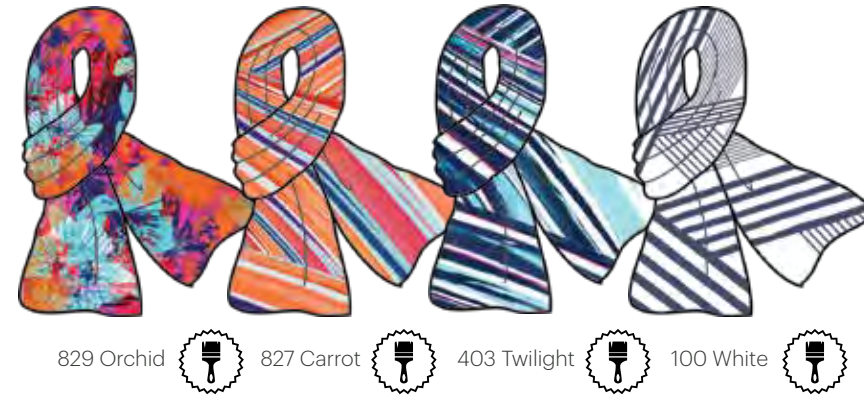
829 Orchid 827 Carrot 403 Twilight 100 White

Make a statement with these light-weight, single-wrap scarves with funky florals and pops of color.