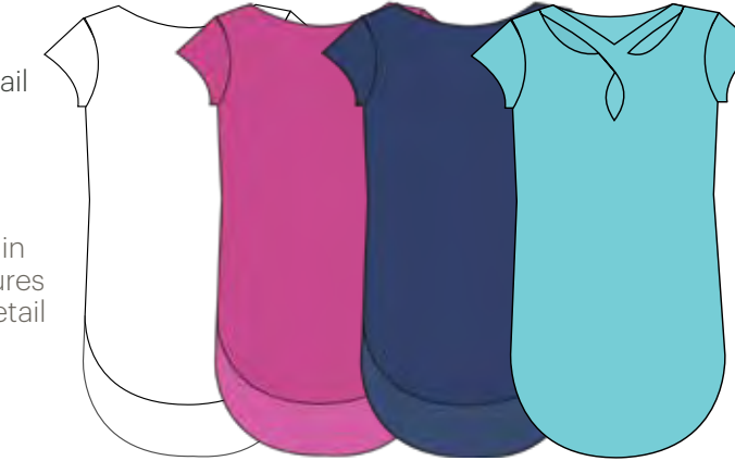
100 White 540 Raspberry 403 Twilight 449 Rain

29" Shirttail Tunic Criss-cross back detail Rayon / Spandex XS-XL