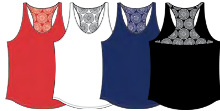
622 Poppy 100 White 403 Twilight 001 Black

Here is your go to tank for summer. In four basic colors, it suits any style from skorts to skinnies.