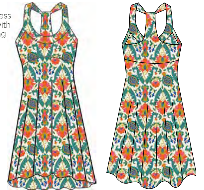
100 Wallpaper White

1102 Frida 35" Racer Back Dress Built-in shelf bra with removable padding Rayon / Spandex XS-XL