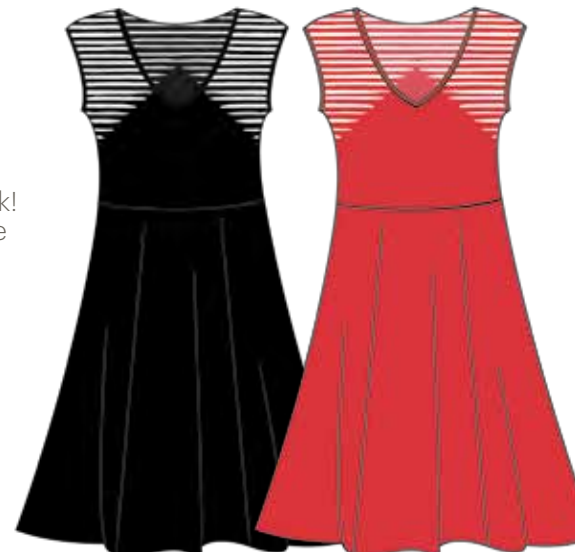
001 Black 622 Poppy

The fit and flare dress is back! This time in a nautical theme that's pure Americana.