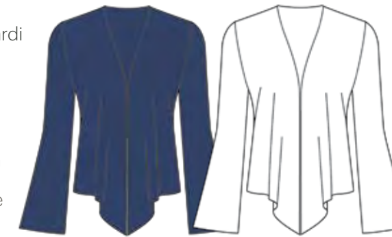
403 Twilight 100 White

21.5" Bell-Sleeve Wrap Cardi Viscose / Nylon XS-XL