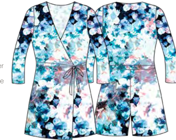
403 Digital Floral

31" Wrap Romper 5" short Rayon / Spandex XS-XL