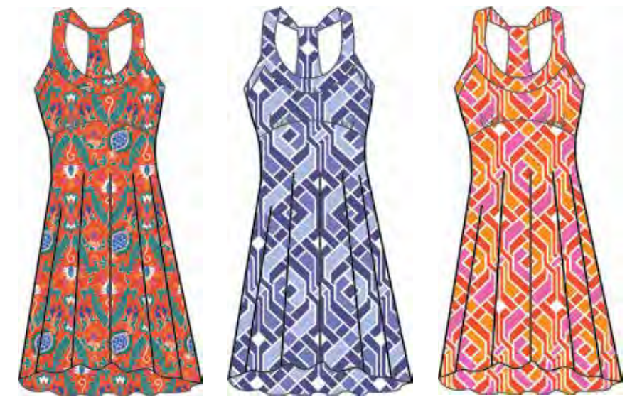
810 Wallpaper Orange

This racerback dress is ready for travel, adventure, or just sipping sangria on a patio. Cheers to sandals and sun hats!