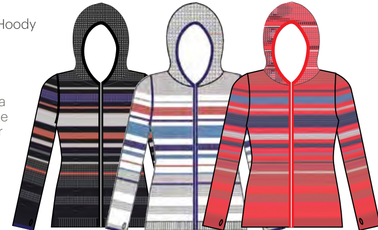
001 Black 100 White 622 Poppy

This full-zip hoody in a striped pointelle is the perfect outer layer for spring and summer.