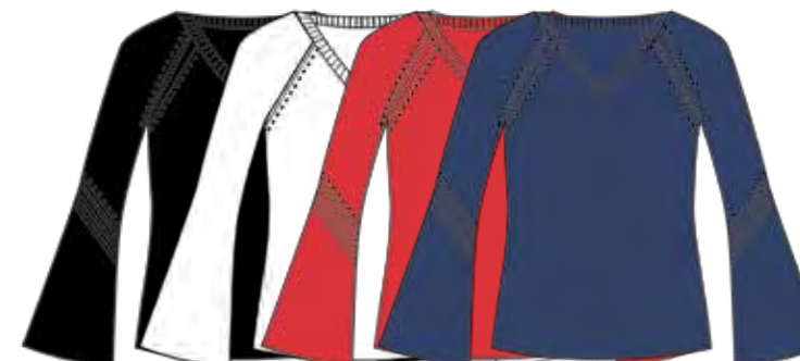
001 Black 100 White 622 Poppy 403 Twilight

This long-sleeve knit features a bell sleeve and interesting knit details at the elbow and shoulder. Pair it with a straight skirt for a silhouette that's flattering and fun.