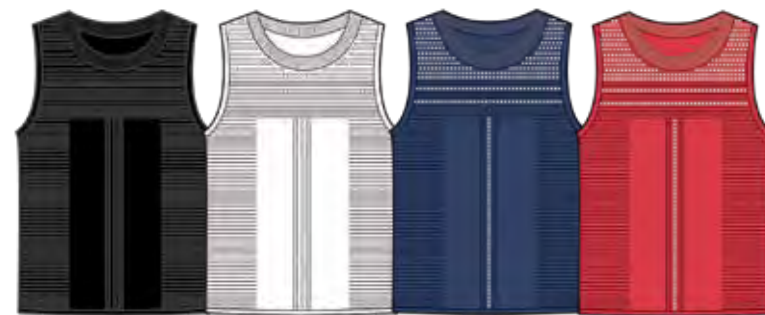
001 Black 100 White 403 Twilight 622 Poppy

This knit tank features a picot hole detail that creates texture and interest and keeps you cool as a cucumber.