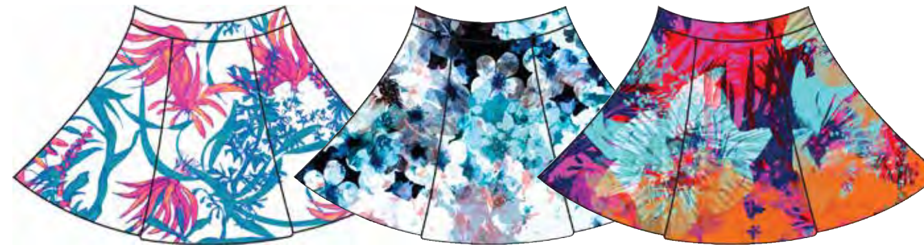
444 Tropical 403 Digital Floral 819 Orchid

Go ahead, give it a twirl! This high-waisted swing skirt is as comfy as it is cute.