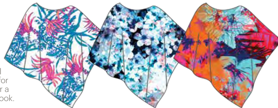
444 Tropical 403 Digital Floral 829 Orchid

This asymmetrical topper is perfect for summer nights for a polished layered look.