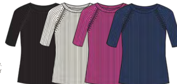
001 Black 106 Chalk 540 Raspberry 413 Navy

This solid, half-sleeve top is rich in color and texture. Pair it with a flared skirt for an outfit that's ready for work or play.