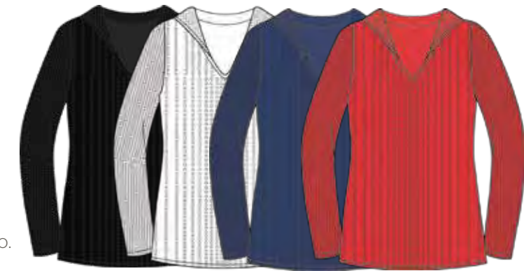
001 Black 100 White 403 Twilight 622 Poppy

A picot hole hoody that's lightweight, yet cuts the chill, for a pack-away layer when you're on the go.