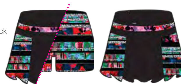
001 Floral Stripe Black with attached short

Be bold in this ruffle skort with built-in shorts, a zippered key pocket and a fun ruffled back panel.