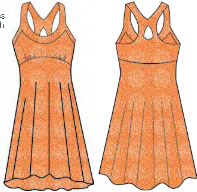
827 Medallion Carrot

1101 Piper 35" Racer Back Dress Built-in shelf bra with removable padding Rayon / Spandex XS-XL