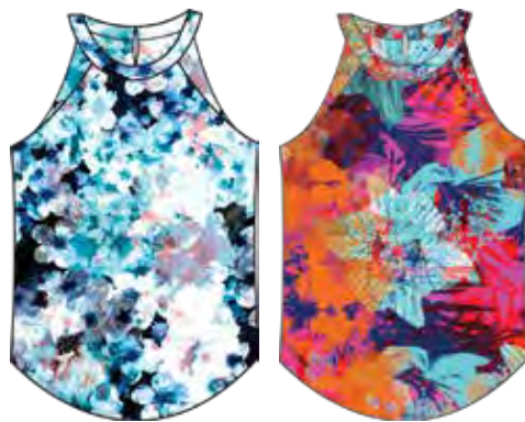
403 Digital Floral 829 Orchid

Bare your shoulders and free your mind. Compliments guaranteed with this bright, bold top.